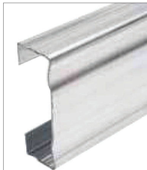
Sideguard Magnelis Rail shown with Grey Header